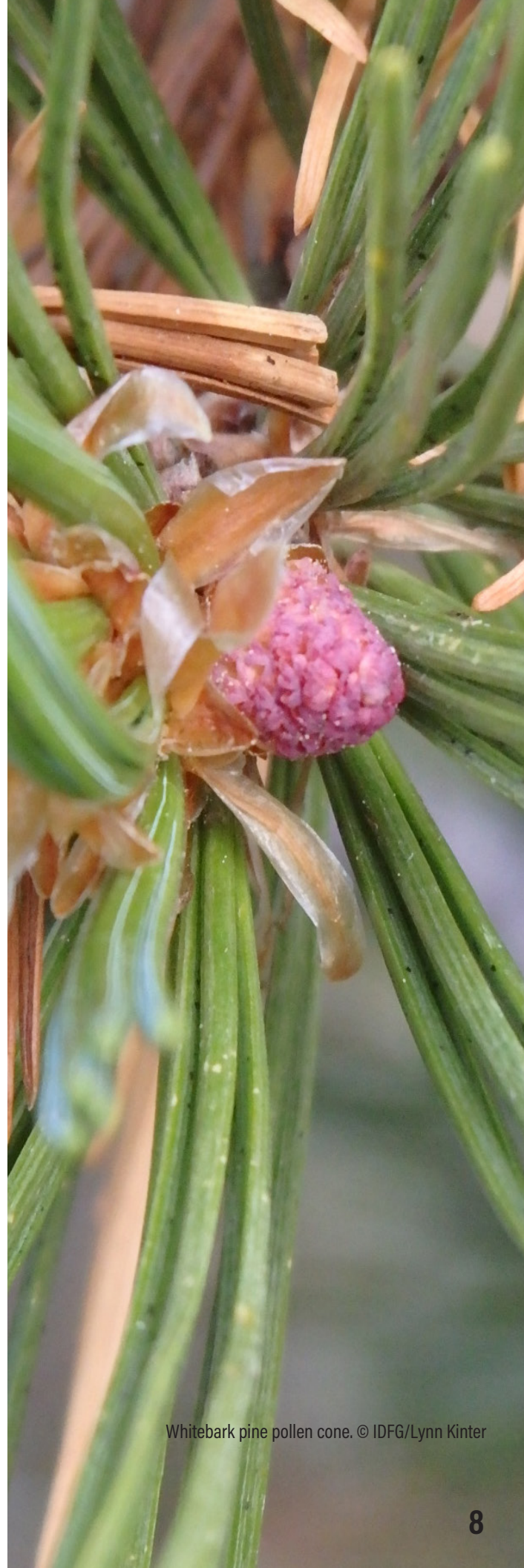
Whitebark pine pollen cone.

Whitebark pine is considered both a keystone and foundation subalpine species because of its role in structuring high elevation communities and stabilizing ecosystem processes. It is an important regulator of soil and snow dynamics as it stabilizes rocks and soil, protects snowpack, slows snowmelt, and modulates runoff and stream flow in high elevation watersheds. This species