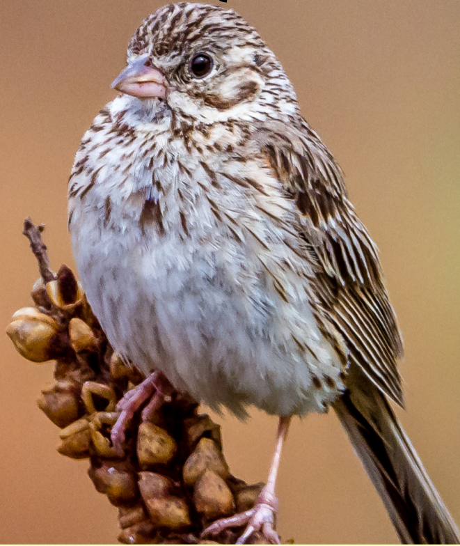
Song sparrow

Thank you to those who made direct donations, purchased or renewed a wildlife license plate, or let us know of a tax check-off donation between January 1 - March 31, 2017.