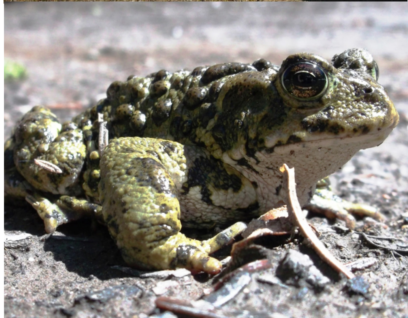
Top: Non-native bullfrog; Middle: IDFG is working with Canadian partners to implement a bullfrog control program to protect an endangered population of northern Leopard frogs; Bottom: Western toad © IDFG/Michael Lucid.