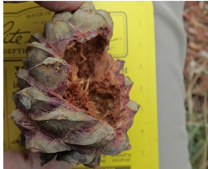
Top: A Clark's nutcracker prying seeds from a cone of a Whitebark pine. © (CC-BY-SA) by Marshal Hedlin on Flickr CC Middle: Whitebark pine seed cone © IDFG/Lynn Kinter; Bottom: Whitebark pine. ©IDFG/Jennifer Miller