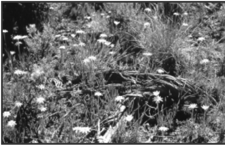
This Agoseris, or mountain-dandelion, is “sage grouse ice cream.” It’s one of many forbs that grouse and other wildlife eat.