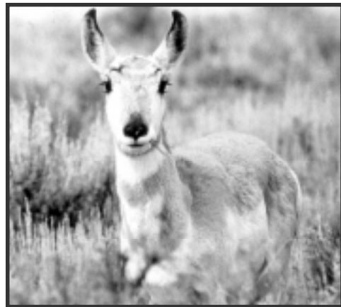
Environmental Science and Research Foundation

shrubs and grasses (Peterson 1995). Pronghorn, pygmy rabbits, and sage grouse may eat exclusively sagebrush in winter, and sagebrush also becomes a major portion of mule deer and elk diets. Taller sagebrush provides cover for mule deer and sage grouse (Dealy et al. 1981), and the crowns of sagebrush break up hard-packed snow, making it easier for animals to forage on the grasses beneath (Peterson 1995). Throughout the rest of the year, sagebrush provides food for pygmy rabbits and sage grouse; protective cover for fawns, calves, rabbits, and grouse broods; and nesting sites for many shrub-nesting birds. The sage thrasher, Brewer's sparrow, sage sparrow, and sage grouse most frequently nest in or beneath sagebrush.