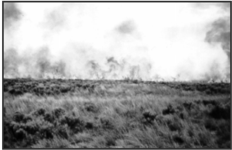
Fire was, and still is, an important part of the sagebrush shrubland ecosystem. Part of the mosaic pattern in sagebrush is due to fires, which tend to burn in patches, creating stands of sagebrush of varying ages.

After a fire, big sagebrush must be re-established by wind-dispersed seed or seeds in the soil. Most sagebrush seeds fall within 1 m (3 ft) of the shrub