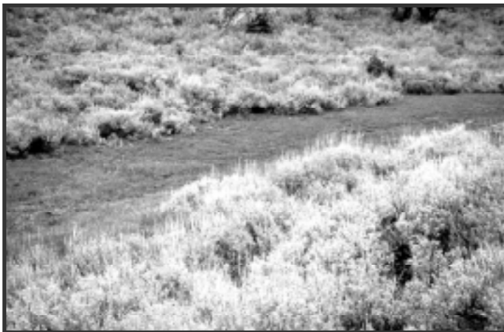
Springs, wet meadows, and riparian areas within sagebrush shrublands add diversity. They provide water, succulent forbs, and abundant insects for many wildlife species. Sage grouse rely on these areas in the brood-rearing period.

We cannot overstate the importance of healthy plant communities around streams, ponds, springs, seeps, wet meadows, and wetlands to birds and other wildlife, especially in arid country. These areas provide water, abundant insects and forbs for eating, and grasses and forbs for cover. Water developments for livestock or wildlife can use water that is already available (such as springs and seeps) or harvest water that is otherwise unavailable (such as wells and catchments). Be sure to evaluate the benefit of water developments against their effect on aquatic and riparian vegetation, the water table, and potential for attracting undesirable animals or plants.