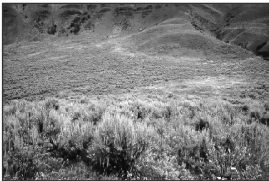
Michael Mancuso, Idaho Conservation Data Center

To many of us, sagebrush country symbolizes the wild, wide-open spaces of the West, populated by scattered herds of cattle and sheep, a few pronghorn antelope, and a loose-knit community of rugged ranchers. When you stand in the midst of the arid western range, dusty gray-green sagebrush stretches to the horizon in a boundless, tranquil sea. Your first impression may be of sameness and lifelessness—a monotony of low shrubs, the over-reaching sky, a scattering of little brown birds darting away through the brush, and that heady, ever-present sage perfume.