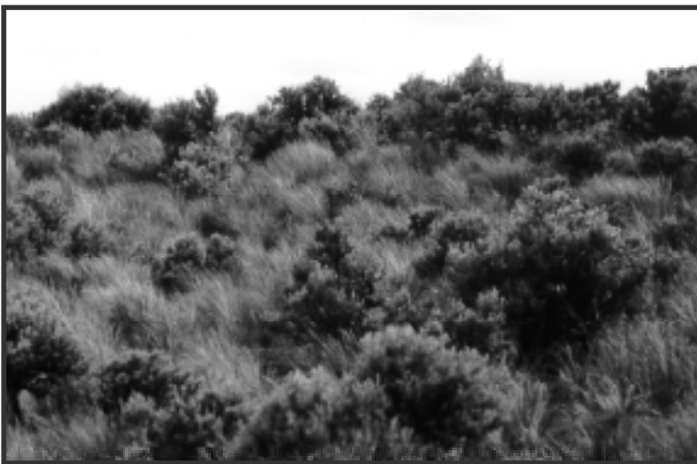
Diane Ronayne, IDFG

Biological soil crust is an integral and usually overlooked component of sagebrush shrublands. It creates a rough crust on the soil surface in semi-arid habitats. Biological soil crust (also known as “cryptobiotic crust,” “microbiotic crust,” or “cryptogamic soil”) is a fragile microfloral community composed of blue-green algae, bacteria,