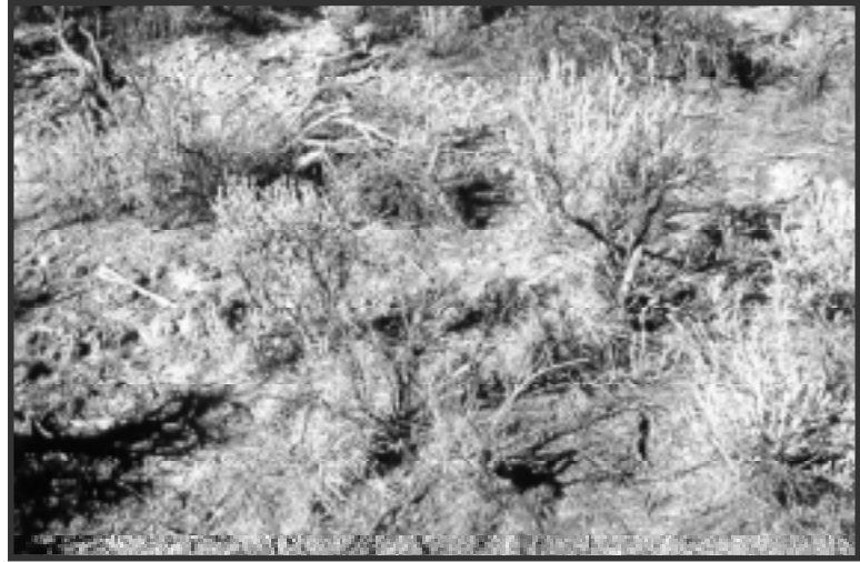
Excessive grazing removes the grasses and forbs between and even under the shrubs. Grazers also trample the soil and occasionally a ground nest.

success. Corrals, feedlots, and watering sites provide feeding sites for cowbirds. Where possible, consider rotating livestock use in order to rest units from cowbird concentrations in alternate years and to give local songbird populations (within a radius of 6.5 km or 4 mi) breeding opportunity without high parasitism pressure.