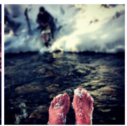
IDFG wildlife biologiy interns contributed 3,379 hours of labor to the project.

This document summarizes $370,577 ($105,043 Cash, $265,534 In Kind) in non-federal contributions to the Competitive State Wildlife Grant project 'Multi-species Baseline Initiative' for the State of Idaho's 2014 Fiscal Year (July 1, 2013-June 30, 2014).