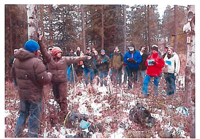
Volunteer Citizen Naturalists contributed 2190.5 hours and 10,781 vehicle miles the project during FY13.