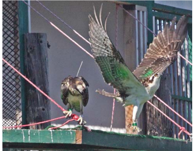
These juvenile osprey, fitted with transmitters and identifiable with green paint, practice flapping their wings before leaving the "nest."

At this time, of the 2 instrumented birds, the female remains near the release site while the male has already begun his journey south and is located in Kansas. Over the next few years, it is thought the birds will