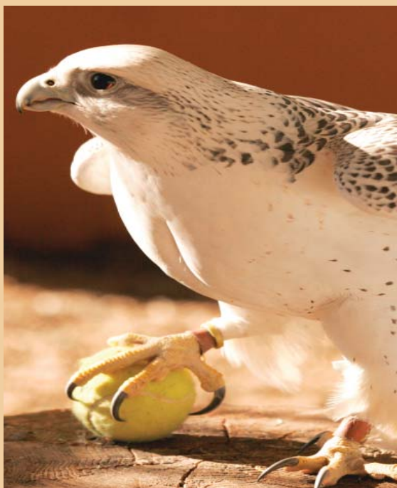
Adult gyrfalcon “playing” with tennis ball; photo by The Peregrine Fund.

Most raptors are supremely adapted to carry prey and other items with their feet. For safety reasons, our birds don’t hunt live prey in their chambers. They do have balls, sticks, stuffed toys, and other items which they grip and/or carry with their feet and talons. Each bird is an individual when it comes to their ‘play’ habits; some will catch an object in the air on the wing, others will just grip it and run across the ground with it. In each instance, the birds are executing instinctive behaviors. Our Swainson’s hawk zips across the floor of her chamber to seize a small ball with swift accuracy – a innate talent essential for hunting beetles, grasshoppers, crickets and other small prey. Falcons dive and hover while pursuing a lure with meat tied to it. Once “caught”, the lure provides the birds with a tasty treat and the chase helps to maintain the bird’s physical and mental fitness. Tennis balls dropped into a large water pan provide our Bald eagle with a diversion and exercise as she splashes about, grasping at the bobbing targets with powerful feet.