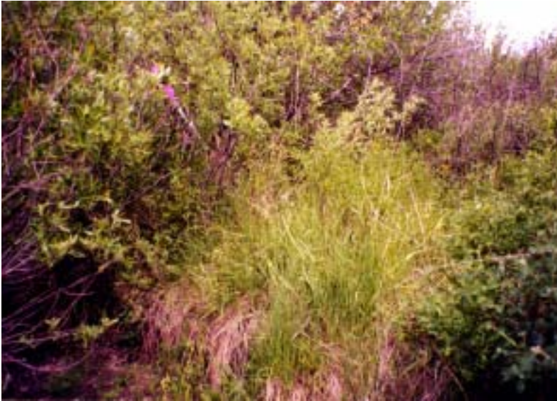
Figure 3. Photos showing Carex aboriginum habitat. Upper-left: grassy gap on alluvial terrace within scrub-shrub riparian zone at Lower School Creek (003) (taken on June 1, 2001 at middle sub-population); upper right: ephemeraally moist mesic graminoid meadow habitat of lowest sub-population at Mesa (002) (taken on May 31, 2001, looking south toward upper basin); bottom: overview of riparian zone at Sheep Creek/North Crane Creek Confluence (004)— Carex aboriginum grows next to riparian shrubs in lower center of photo (taken on June 5, 2001).