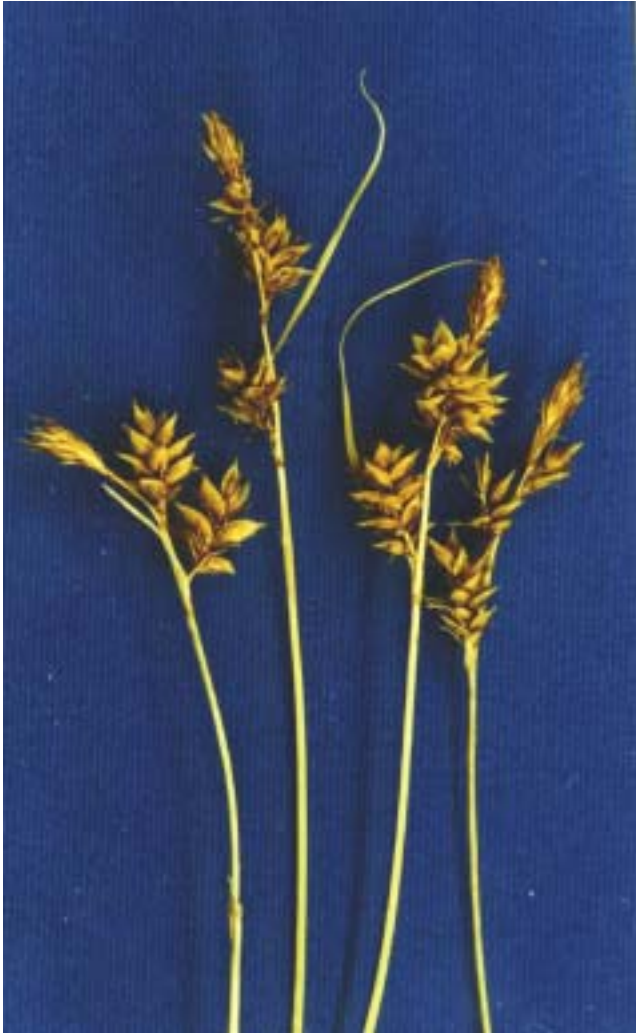
Figure 1. Photos of Carex aboriginum . Top-right photo is courtesy of Anne DeBolt, BLM; bottom-right photo is at lowest sub-population at Lower School Creek (003) (taken on June 1, 2001); left photo is courtesy of Mering Hurd, U. S. Forest Service Rocky Mountain Research Station.