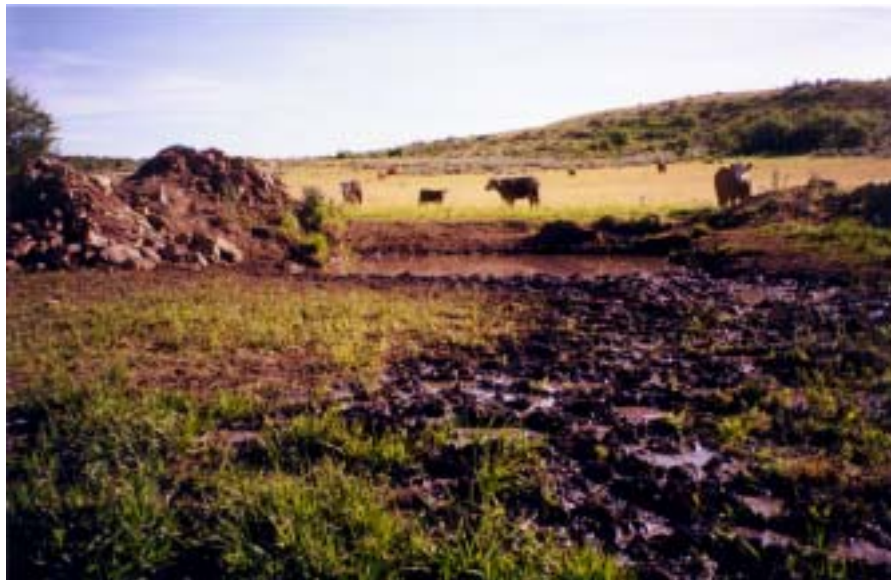
Figure 4. Photo of cattle-watering pond dug into a seep about 10 meters from the lowest sub-population at Mesa (002). Taken on May 31, 2001 from the occupied Carex aboriginum habitat.

The landscape surrounding this occurrence has a long history of cattle grazing and other disturbances. As a result, the uplands are dominated by exotic grasses and only remnants of the sagebrush-steppe and rigid sagebrush mosaic exist. Several ranch houses, the county dump, and a busy gravel road are located within one mile of the occurrence. No off-highway vehicle (OHV) travel into the occurrence area was observed; fences limit travel in the area. In addition, a housing development is underway on adjacent sections of land to the west. The potential of these developments for decreasing groundwater feeding the seeps and ephemerally moist meadow habitats of Carex aboriginum is not known.